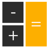
Smart Hide Calculator